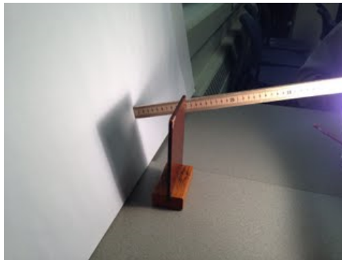
FIG. 1.7 A straight stick can provide a physical model for how light travels.

Figure 1.7 shows an example of using a straight stick as a physical model for how light can be envisioned as rays traveling in a straight line from a light source past the edge of a barrier to the edge of a shadow on a screen.