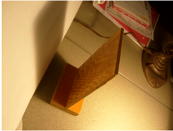
FIG. 1.8 Two kinds of shadows are formed when a barrier is placed between a light source and screen

Question 1.7 introduces an open-ended question that invites you to explore additional light and shadow phenomena by yourself, with a small group of colleagues, and/or with friends and family members: