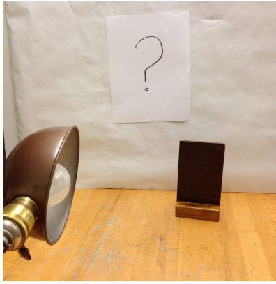
FIG. 1.6 Predict what you will see when placing a barrier in front of the screen.