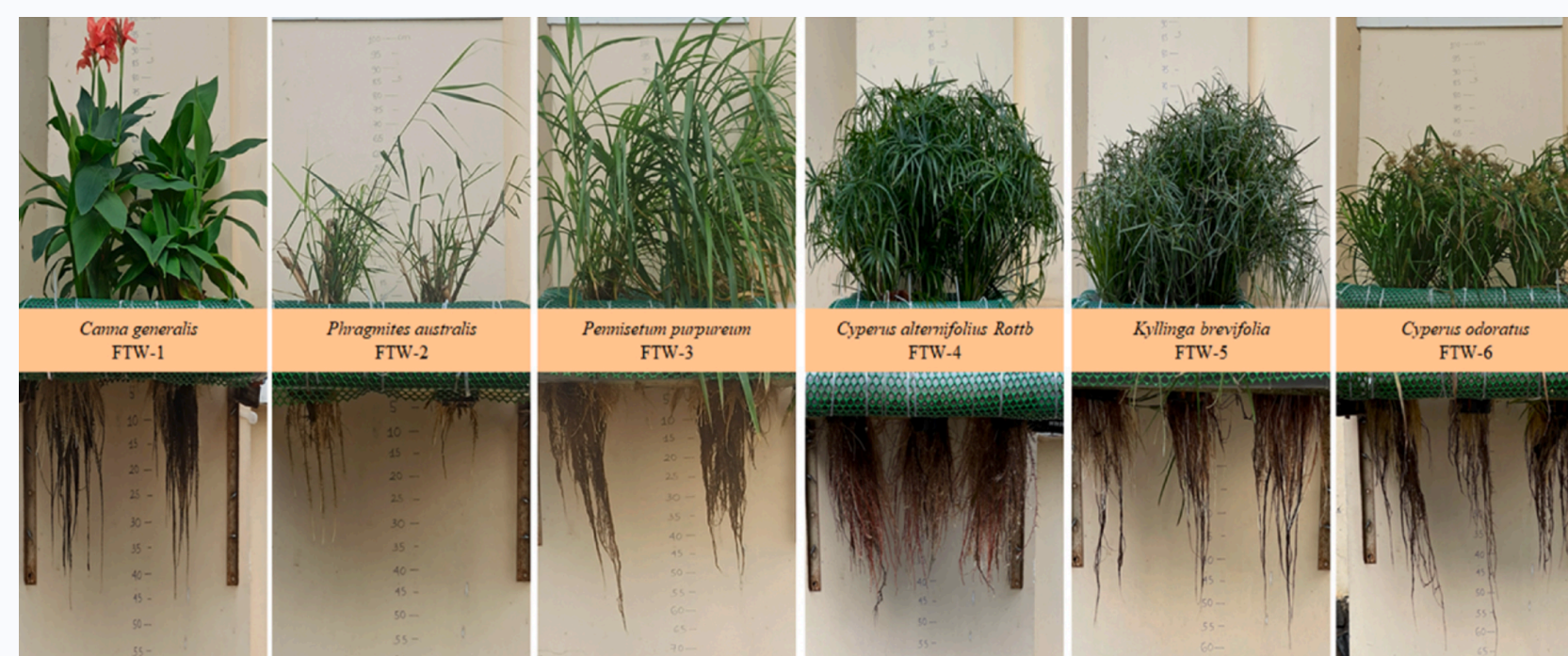
Fig. 1. Lab-scale FTW systems with different plant species: (a) initial system design and (b) after 694 h. Note: FTW-1: Canna generalis ; FTW-2: Phragmites australis ; FTW-3: Pennisetum purpureum ; FTW-4: Cyperus alternifolius Rottb; FTW-5: Kyllinga brevifolia ; FTW-6: Cyperus odoratus ; FTW-C: the control tank ( https://doi.org/10.1016/j.chemosphere.2024.142786 )