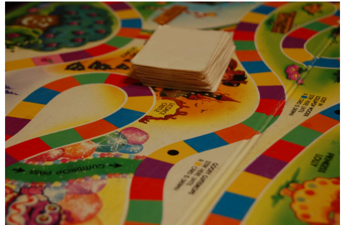
"Candyland" by Dave Parker / CC-BY

In professional and technical communication, it is important to remember your rhetorical foundation in order to minimize the possibility of gaps/roadblocks in order to ensure your information gets where you want it to go — you guessed it! — as efficiently and effectively as possible. Whether you are writing an email to a client, typing a memo for your boss, or preparing a presentation, considering audience, purpose, and context as you draft will help you be an effective communicator and increase your professional ethos.