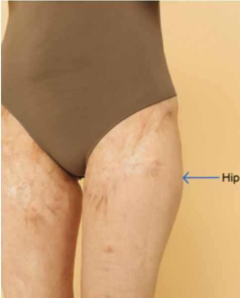
Figure 5: Hip circumference location

The WHO (2008) guidelines indicate that increased risk is associated with waist-to-hip ratios of greater than or equal to .90 centimetres in men and greater than or equal to .85 centimetres.